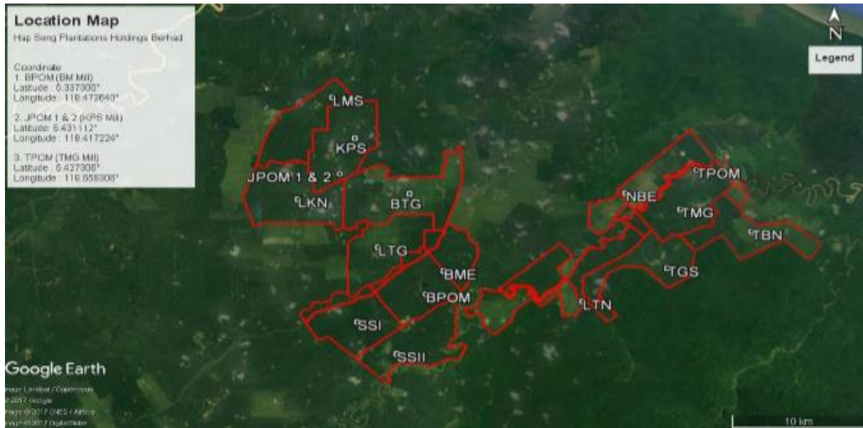
Figure 2: Location of Jeroco POM 1.